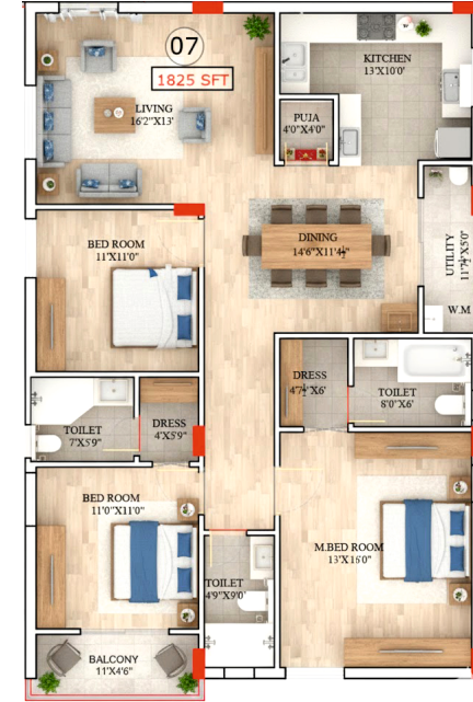
FLAT - 7,8,9,10 - 1825 Sft