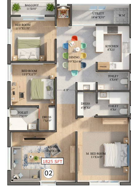
FLAT - 2,3,4,5 - 1825 Sft