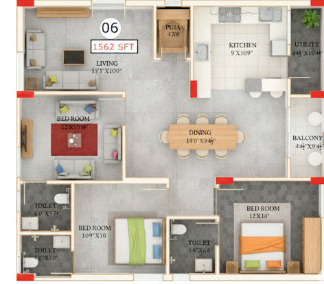
FLAT - 6 - 1562 Sft